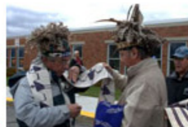
Canandaigua Treaty Commemoration

This year, for the first time, Ganondagan will offer year-round events. Here's a sneak preview of some programs to look forward to: